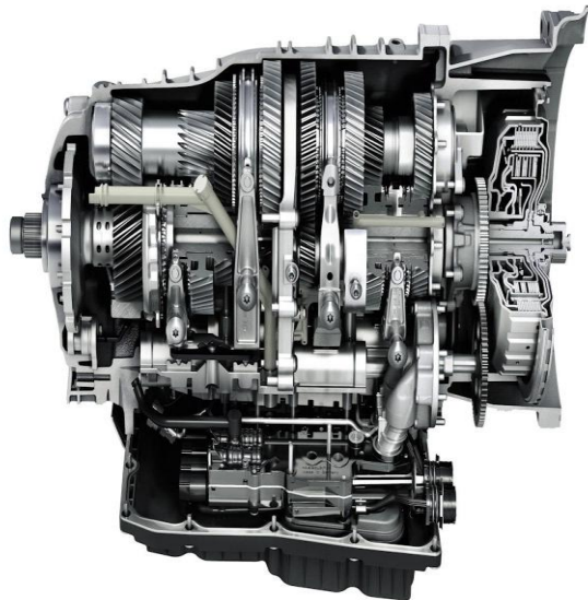
Fig. 1. Actual Model Dual clutch transmission.