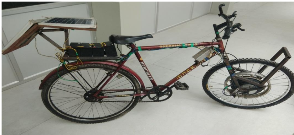
Fig 2: FABRICATED BICYCLE