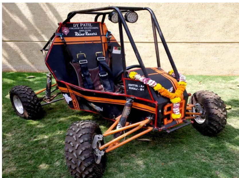
Figure 3: completely designed and manufactured All-Terrain Vehicle.

Thus by using the above calculations and methodology for a suspension system, we have designed the suspension system and analysis has been done before manufacturing the original one by using ANSYS Software and LOTUS Shark software. We have designed the suspension system as on front side A- Arm type suspension system and on rear side H-Arm suspension system. After the fabrication of the vehicle we have tested the vehicle on uneven roads and terrains in order to check the stability of suspension System, weight distribution phenomenon and wheel travel.