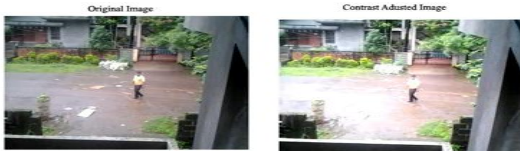
Fig4.5 indicates the with & without contrast adjustment

some off the sequence of frames from video outdoor3. Figure 4.4 indicates the some off the sequence of frames from video indoor.