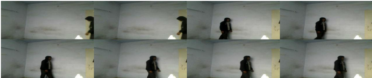
Fig4.4 indicates the some off the sequence of frames from video indoor.

As shown in the Figure 4.1 indicates the some off the sequence of frames from video outdoor1. Figure 4.2 indicates the some off the sequence of frames from video outdoor2. Figure 4.3 indicates the