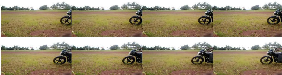
Fig4.2 indicates the some off the sequence of frames from video outdoor2.