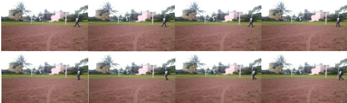
Fig4.1 indicates the some off the sequence of frames from video outdoor1

As in this case we have applied the entropy calculation and then discarding the segment by applying a suitable threshold we get various compression ratios for each video.