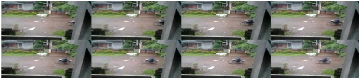
Fig4.3 indicates the some off the sequence of frames from video outdoor3