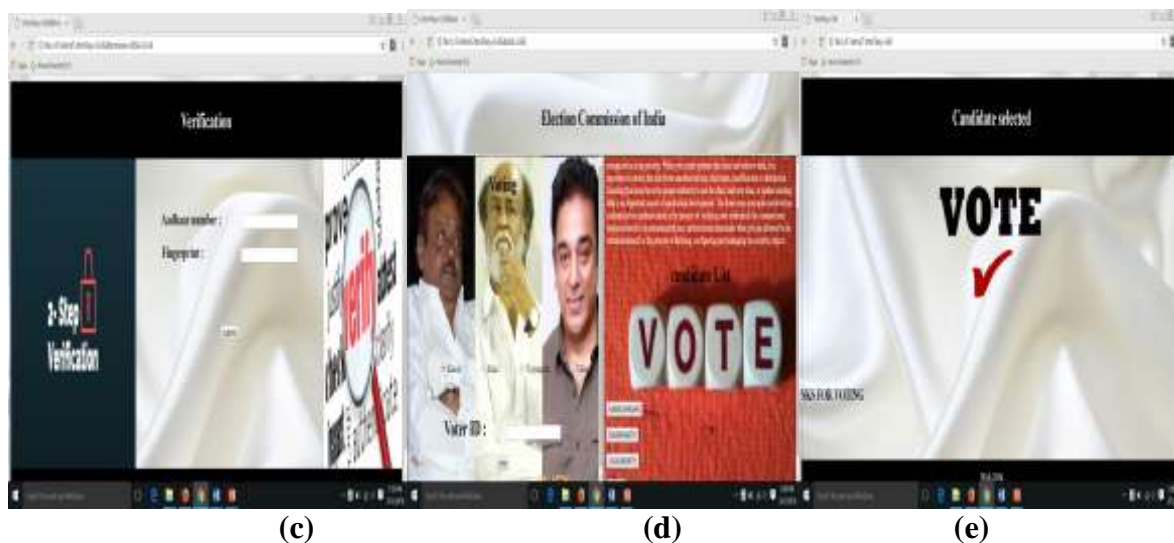
Fig. 2: (a-e): Screenshots